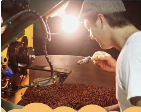
Skillfully Crafted Coffee