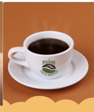
Perfect Hot or Iced