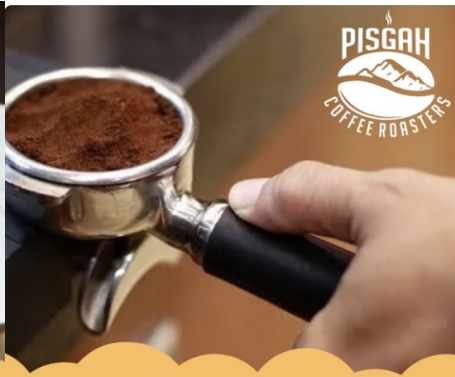
Smooth & Delicious