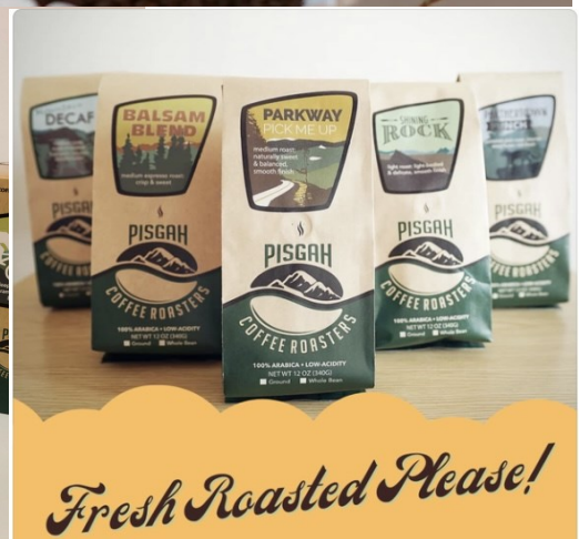
Fresh Roasted Please!