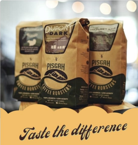
Taste the difference