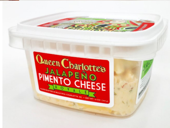
Queen Charlotte Cheese