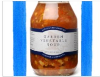
Garden Vegetable Soup