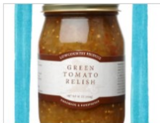
Green Tomato Relish