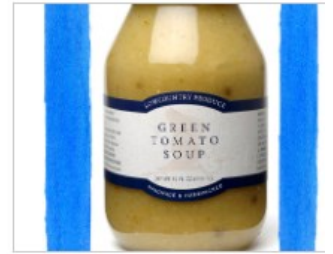
Green Tomato Soup