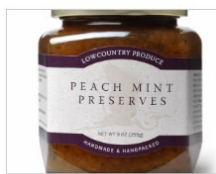
Peach Mint Preserves