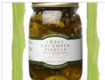
Sweet Cucumber Pickles