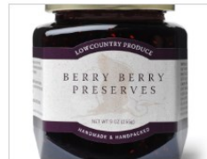
Berry Berry Preserves