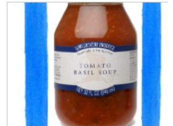
Tomato Basil Soup