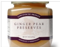
Ginger Pear Preserves