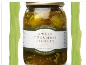
Sweet Cucumber Pickles