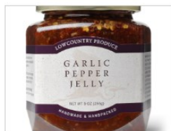
Garlic Pepper Jelly