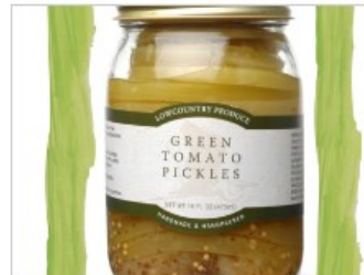
Green Tomato Pickles