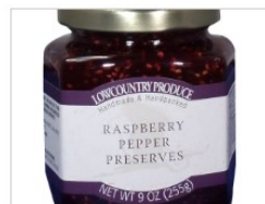
Raspberry Pepper Preserves