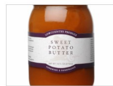
Sweet Potato Butter