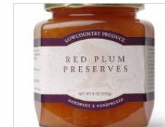
Red Plum Preserves